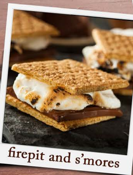
firepit and s'mores